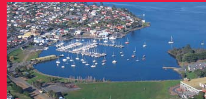
Bellerive Yacht Club, Kangaroo Bay

Leisurely day trips will take you to Port Arthur, the Tasman Peninsula, Bruny Island and the Huon and Derwent Valleys.